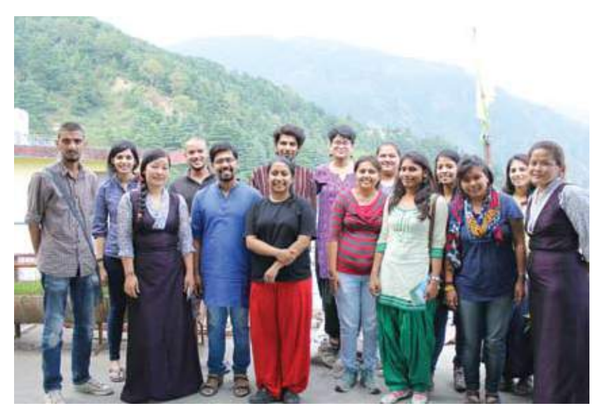
Interaction and discussion with the participants of Little Lhasa Program-SFT.