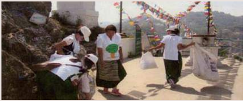
RTWA Mussoorie cleaning the sorrounding on World Environment Day (5th June 2015)