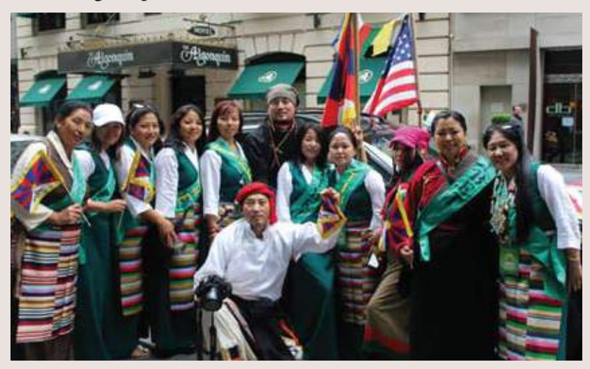
RTWA NYNJ participated in the NY 29th Annual Immigrants Culture Parade representing the Tibetan society and culture in the Big Apple.