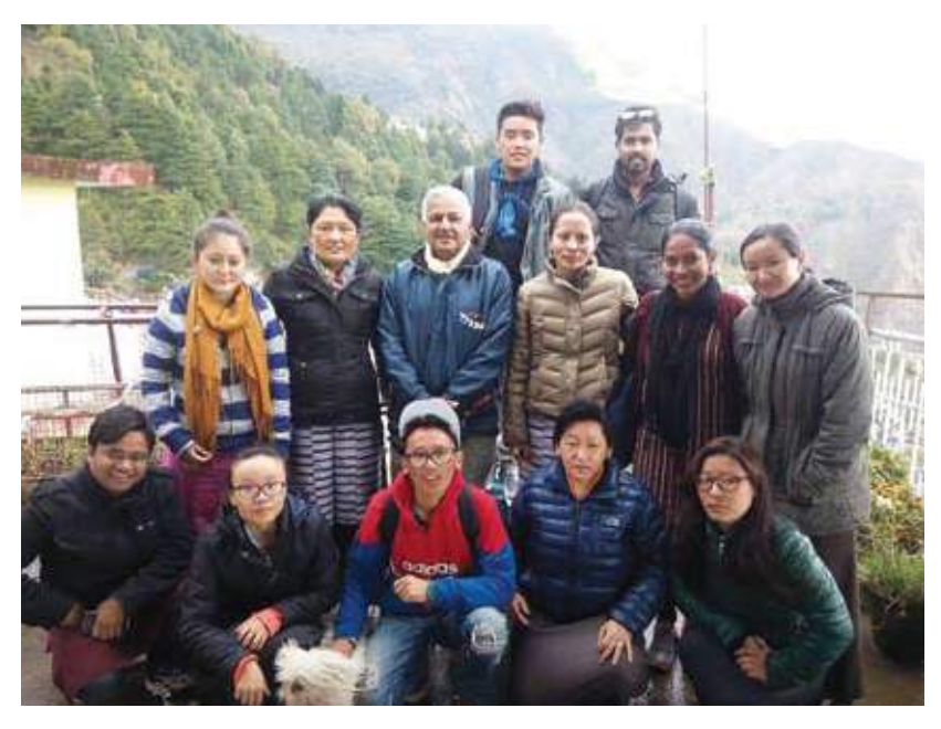
TWA had interactive time with interns and volunteers of Initiatives of Change (IofC), Asia Plateau, India