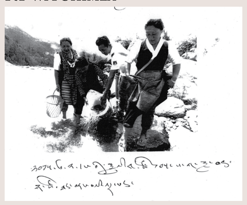
RTWA Shimla released fishes into the river on Saka Dawa (sacred day).