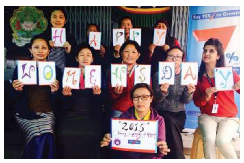
Commemoration of 'Women's Day' in collaboration with Yes Bank.