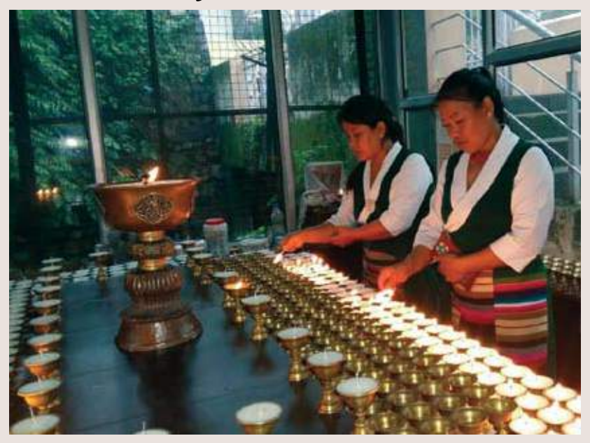
On 15th July 2015, RTWA Rajpur lighted 108 butterlamps for the swift rebirth of Tenzin Delek Rinpoche.