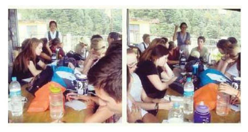
TWA interacts with students from Tulane University, New Orleans, Los Angeles.