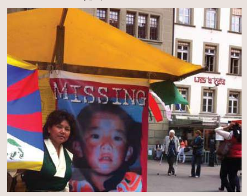
RTWA Switzerland calls on the Chinese government to disclose the whereabouts of Panchen Lama of Tibet.