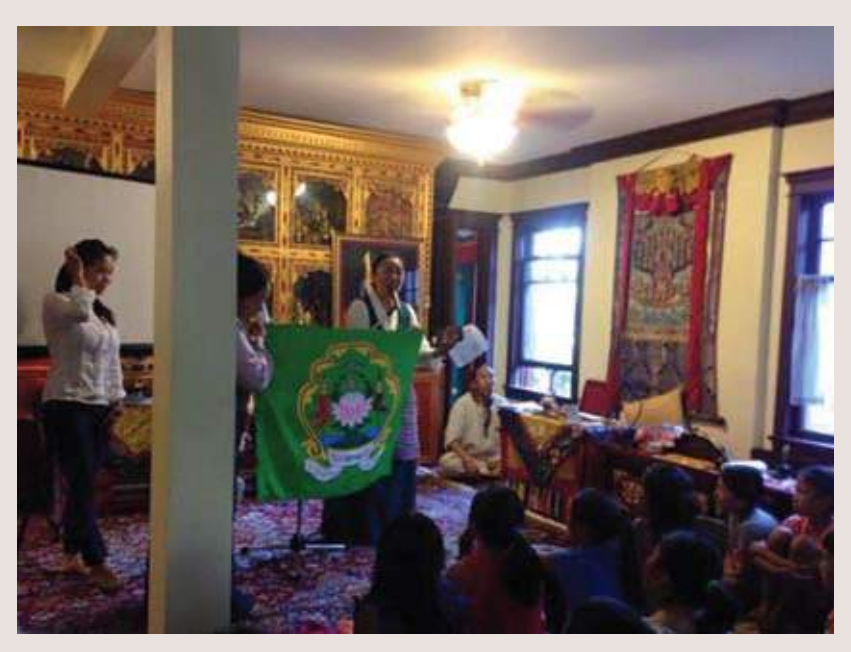
RTWA Ontario organized a dental Hygiene workshop for kids.