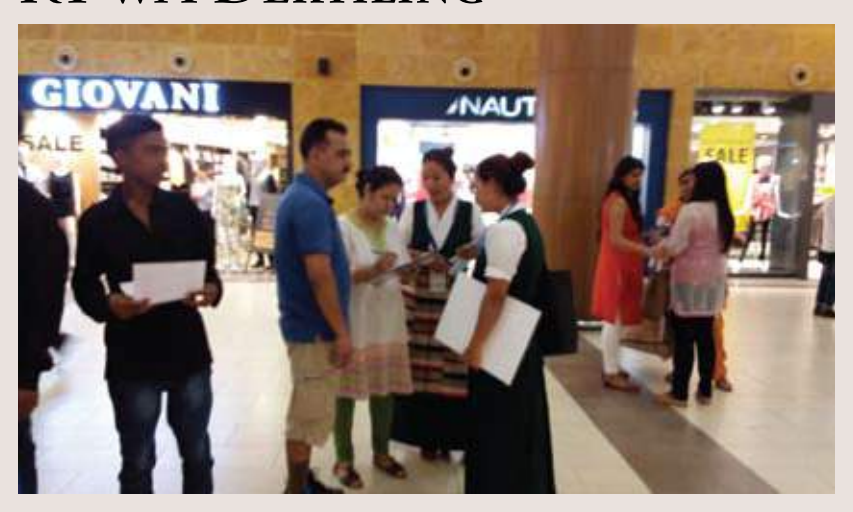
RTWA Dekyiling did a signature campaign due to the demise of Tenzin Delek Rinpoche in Chinese prison at mall and market.